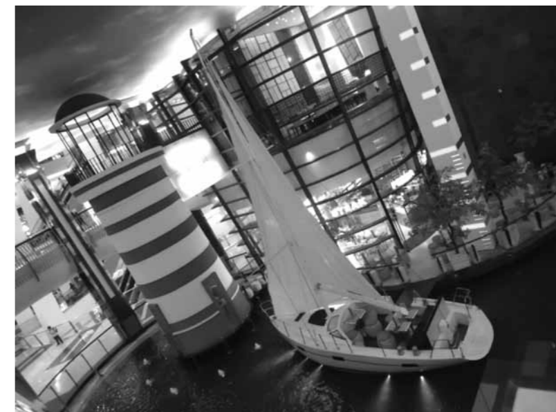
Image 1. Atmosphere that Provides Experience in a Jakarta Shopping Center

Shopping center design creates new experience through the atmosphere that is perceptually felt by the human senses. New forms and concepts as well as creative ideas regarding the creation of experience and how to have a shopping center with a point of interest for consumers should be considered. Similar to a recreational center, a unique design will help tenants creatively create a theatrical store ambience for visitors. This way, visitors can feel the comfort of shopping with more introductions of new experience created by retailers. This experience involves various sensory reactions (for instance visual appearance, sound, smell, and texture).